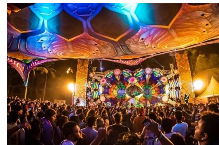
Night Out at Bergamo