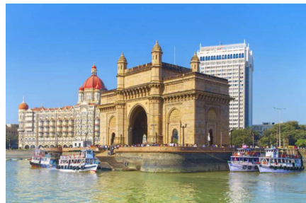
Visit the Gateway of India