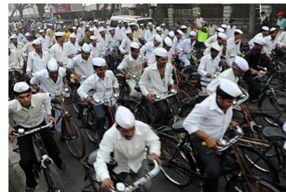
Learn about the famous 'Dabbawalas'