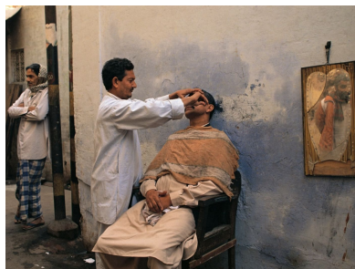
Old Delhi & its markets