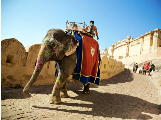
Amber Palace and Jaigarh Fort