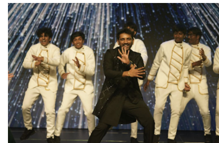
Participate in a Bollywood dance class