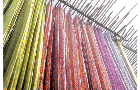
Block Printing Class